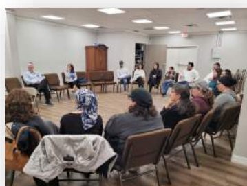
Partial view of the crowd at the JFS talk about family safety.